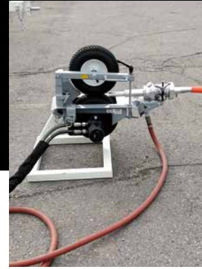
FIGURE 8 STAND

Our Portable Hydraulic Power Pack is modified to power our Figure 8 Device and accepts our manifold for our Fiber Blower. This unit will allow you to blow fiber without the need to be at the trailer. Use it as a stand-alone blower or in a piggyback situation.