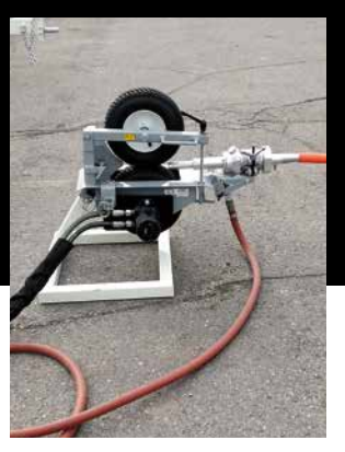
FIGURE 8 STAND

Our Portable Hydraulic Power Pack is modified to power our Figure 8 Device and accepts our manifold for our Fiber Blower. This unit will allow you to blow fiber without the need to be at the trailer. Use it as a stand-alone blower or in a piggyback situation.