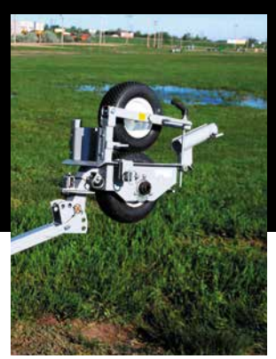
ADJ. POLE FOR FIBER BLOWING

The Articulating Pole for the Figure 8 Device and Fiber Blower allows for several different configurations to fit the situation you are working with.